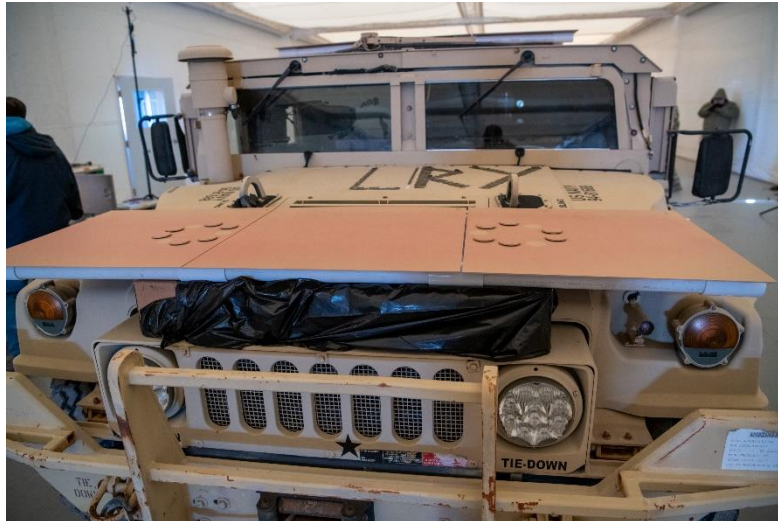
A military vehicle undergoes testing and demonstration of a protective overcoating using sample panels during a demonstration in 2022. (U.S. Army photo by Dugway Proving Ground Public Affairs).

Aberdeen Proving Ground, MD – The U.S. Army Combat Capabilities Development Command Chemical Biological Center (DEVCOM CBC) is exploring the use of protective overcoats on military vehicles to reduce hazards to the warfighter and reduce the resources needed to decontaminate the vehicles. The aim of the project is to reduce the amount of time it takes to decontaminate military equipment and improve the readiness of warfighters during their missions.